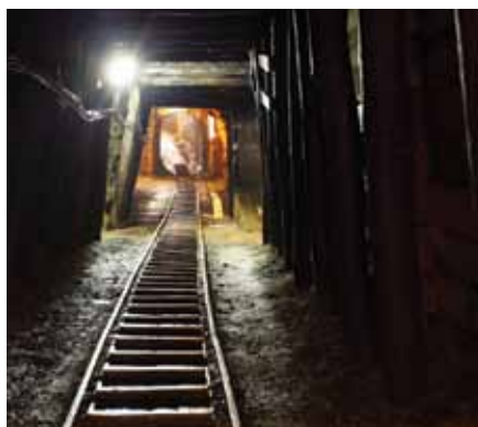
| iCAM501 Ultra has ATEX & IECEx M1 mining approval