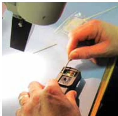
| iCAM501 Assembly in the Extronics Vision Lab

Over the past five years Extronics has made substantial investment in R & D, technical skills and production equipment to create a range of vision solutions that deliver real value to customers.